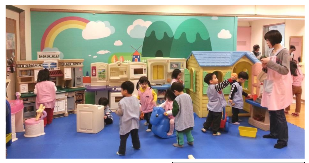
The Taipei YWCA Nursery School

Quality child care services is a pressing need for busy working parents. The courses provided in the three nursery schools established by the Taipei YWCA are designed to incorporate gender education and character cultivation. The courses cultivate a respective and tolerant manner in children for them to become first-class junior citizens of the global village.