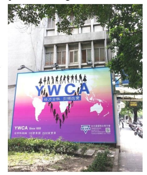
Taipei YWCA Image Signboard