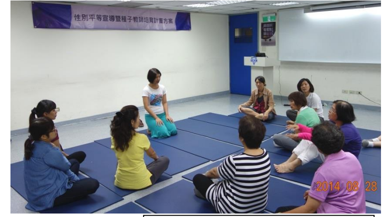
Workshop of Seed Teacher Training

2.Seed Teacher Training program: Based manly on gender book clubs and body workshops, this course, through discussions and theater games, allows participants to explore and become aware of the limitations of gender and body to heighten gender sensitivity. A total of 8 sessions were held between June and December, with 103 persons participating.