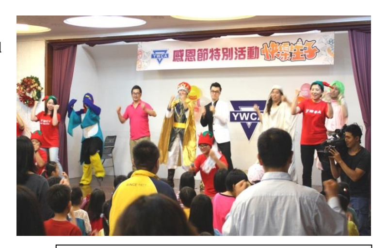
Thanksgiving Day Children's Theater Performance

(a) World Prayer Day: This was was held at the Church of Christ the King in Shihlin, Taipei on March 7. The theme was "Streams in the Desert," and around 140 persons participated, including Taipei YWCA's board members, staff members, and the Women's choir. (b) World YMCA and YWCA United Common Prayer: This was held on November 15, and November 17-18. The theme was "Courage to Change Leadership," and a total of 406 persons participated.