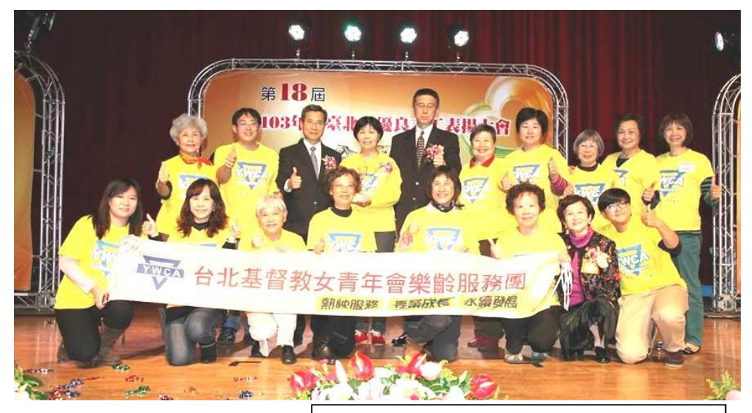
Senior Volunteers Team Won Diamond Award